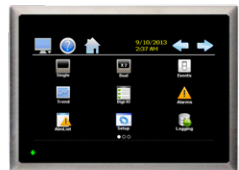
Icon - Based Navigation