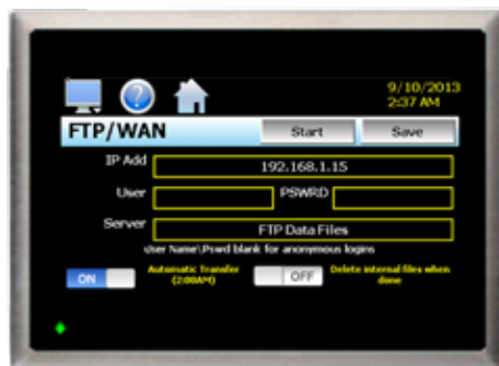
FTP Data Back Up